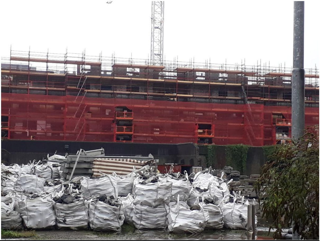
Circle Railway Street site