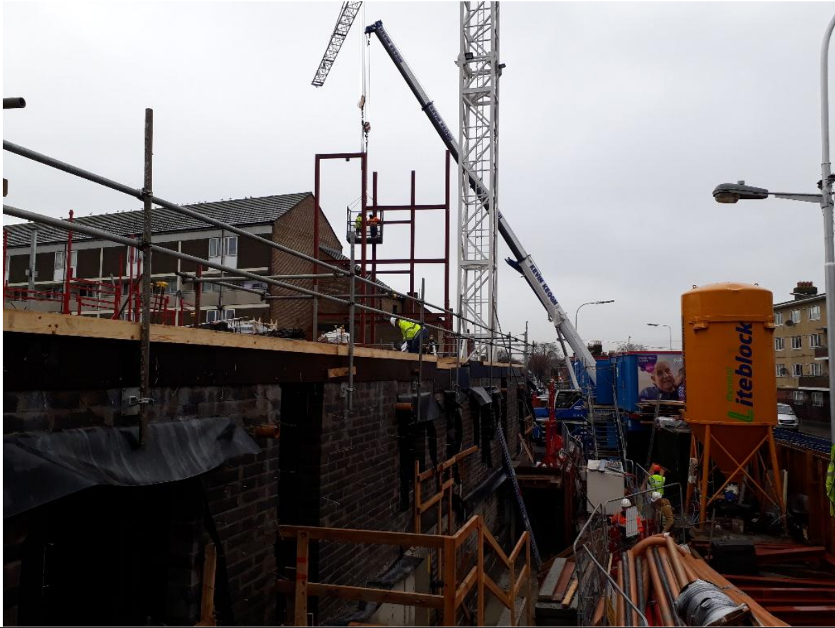
Steel works have now begun on the end of the building to form internal stairwell.