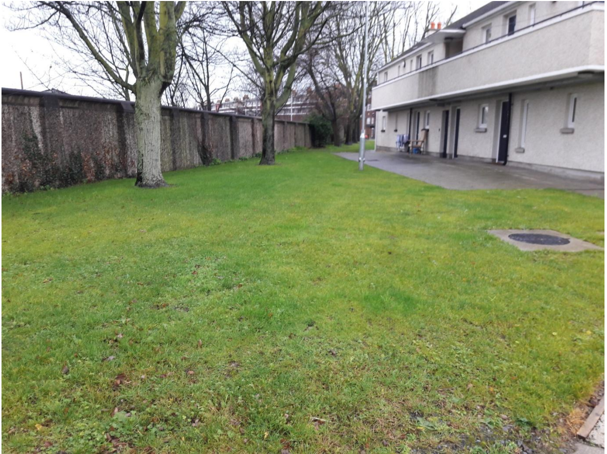
Croke Villas / Ballybough Road: