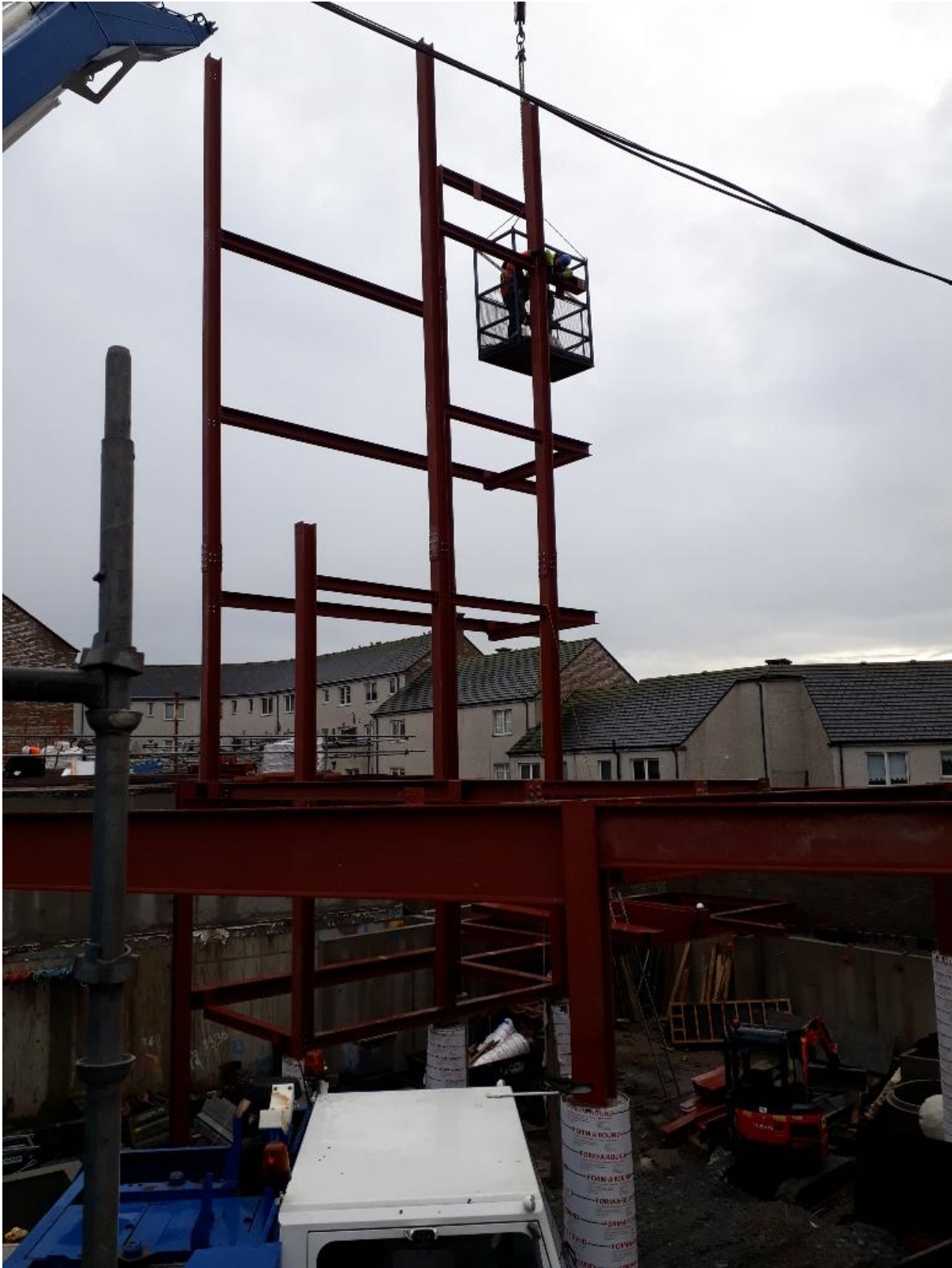
Brendan Behan Older Persons complex: